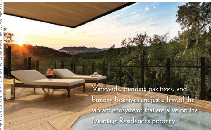
Vineyards, budding oak trees, and buzzing beehives are just a few of the vibrant ecosystems that are alive on the Montage Residences property.

slope of the Teton mountain range, and also in a high alpine valley, which makes it a “biodiversity hotspot.”