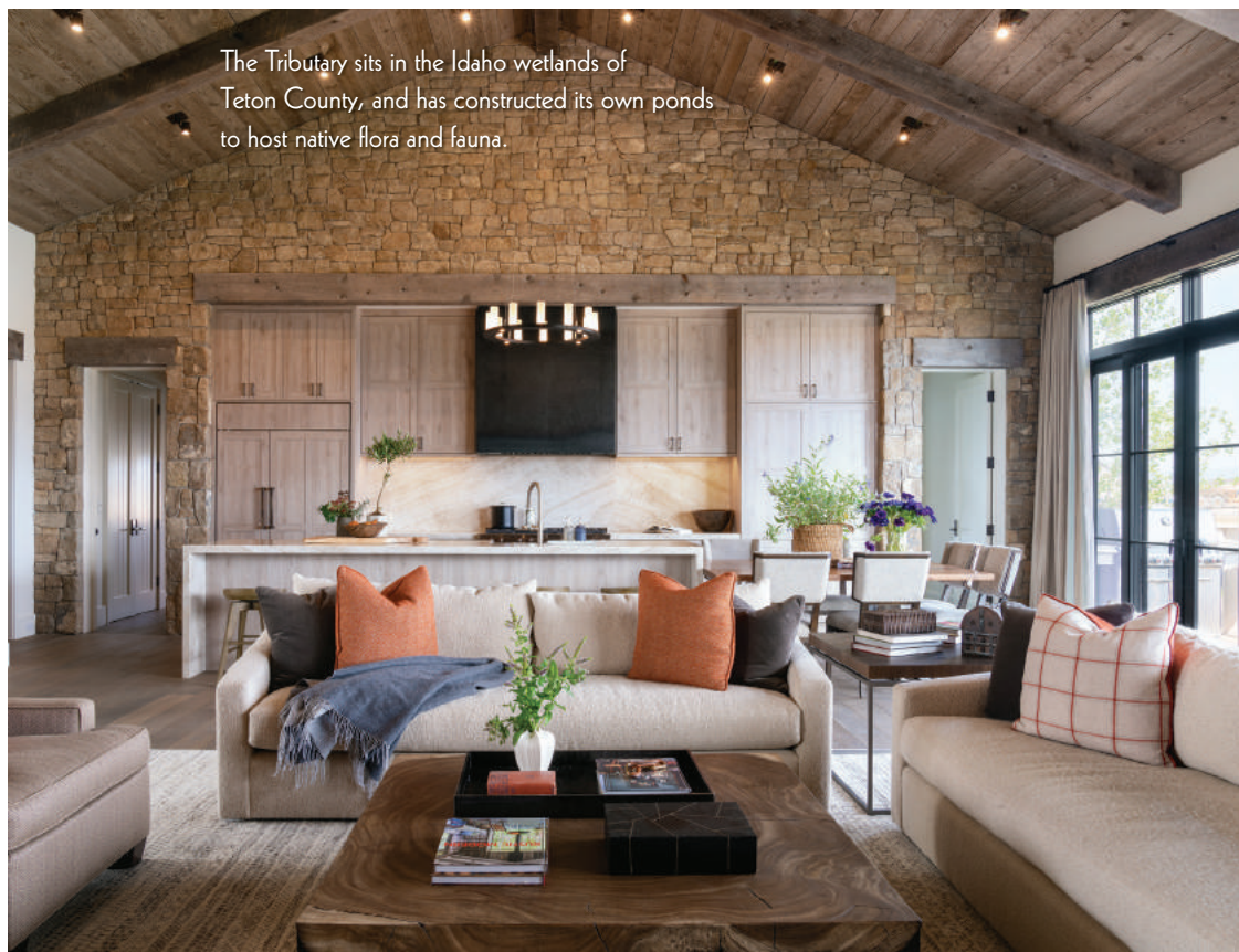
The Tributary sits in the Idaho wetlands of Teton County, and has constructed its own ponds to host native flora and fauna.