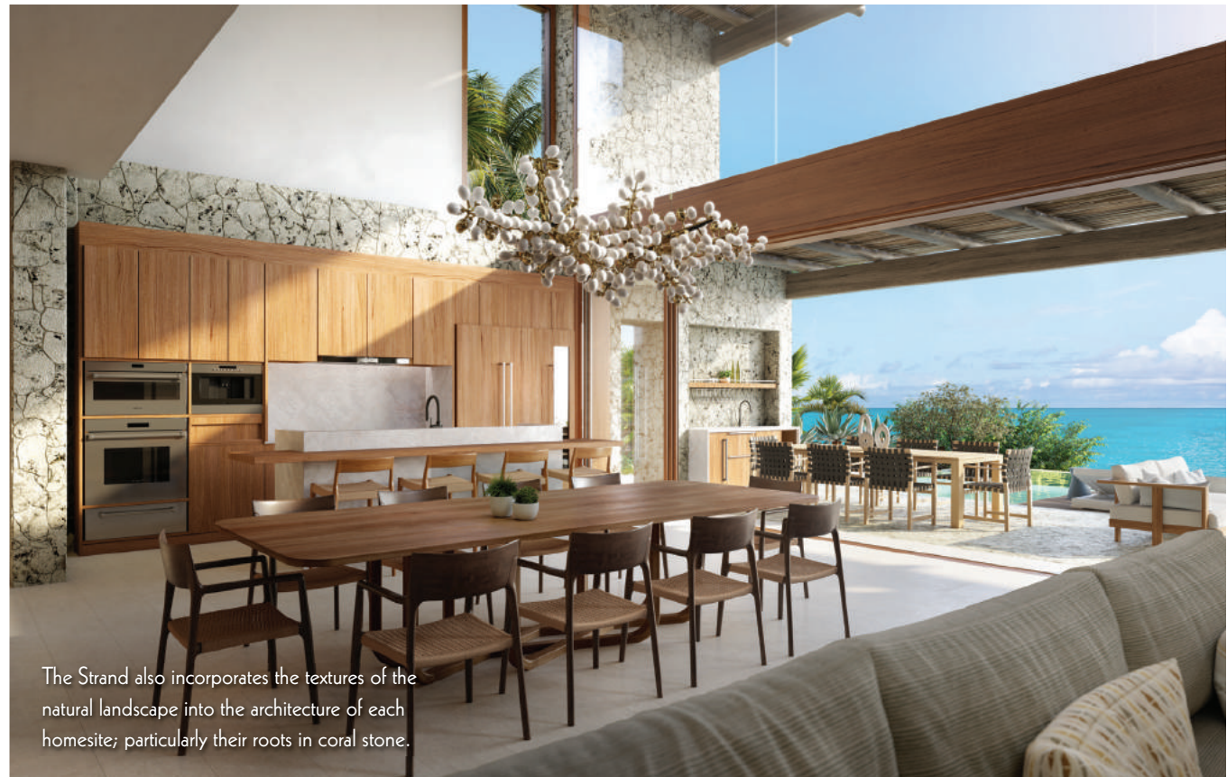
The Strand also incorporates the textures of the natural landscape into the architecture of each homesite; particularly their roots in coral stone.

The land itself is entrenched in rich, vast ecosystems, and residents can enjoy being a part of it all. Tributary is situated in the western