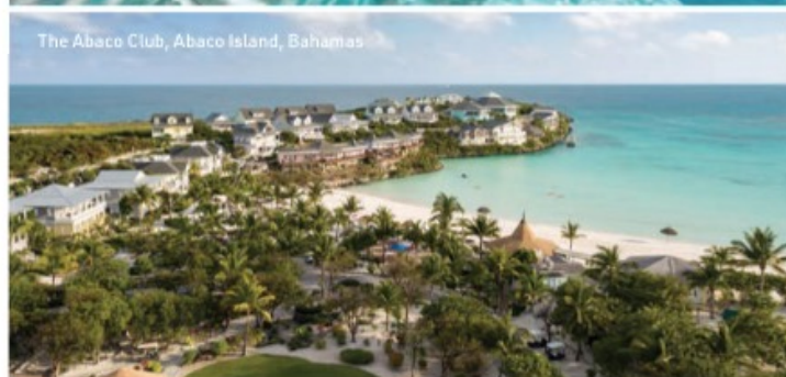
The Abaco Club, Abaco Island, Bahamas

in the history of the Dominican Republic, includes the Astor Penthouse, the Caribbean Penthouse, and six Astor Penthouse Residences. These Astor units, all three- to seven-bedroom homes, range in price from $7.6 to $25 million—the ultimate in island living. srresidencescapcana.com