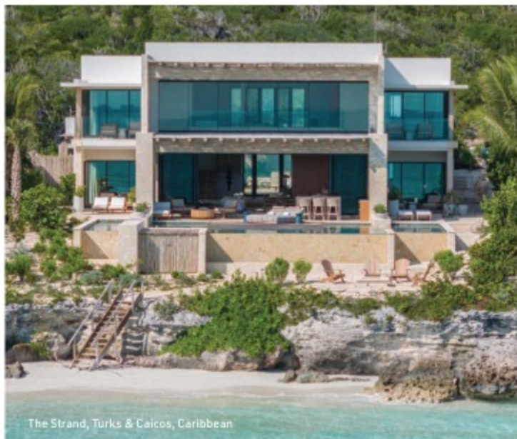
The Strand, Turks & Caicos, Caribbean