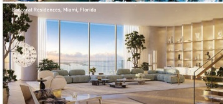
Baccarat Residences, Miami, Florida