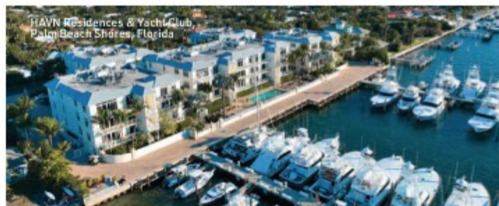
HAVN Residences & Yacht Club, Palm Beach Shores, Florida

Located on the Punta Espada Golf Course, the Residences at the St. Regis Cap Cana , the first and only five-star branded real estate offering in Cap Cana, is set to be complete this year. The property will include 70 luxury residences, with a collection of eight penthouses. The Astor collection, some of the most expensive homes